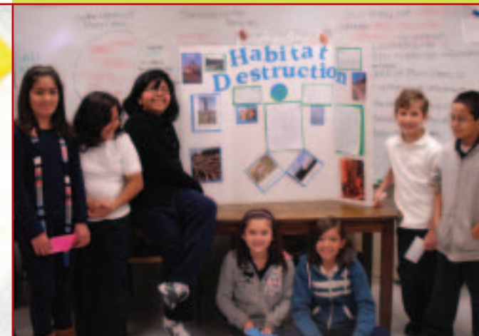
Student presentation on habitat destruction