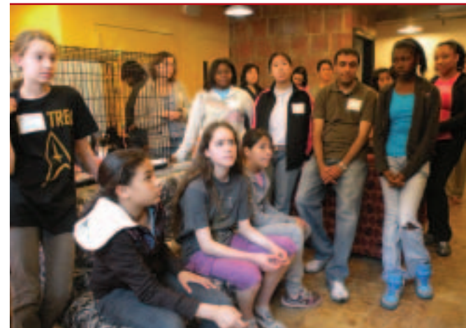
Youth Service Day with Big Brothers Big Sisters NYC at Animal Haven