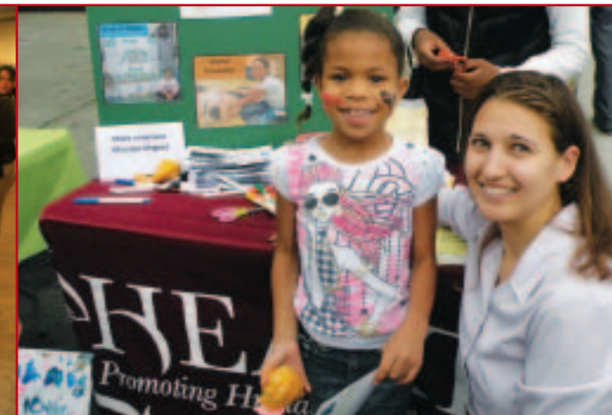
Tabling at the Hunts Point Alliance for Children Fair